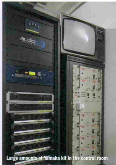
Large amounts of Yamaha kit in the control room