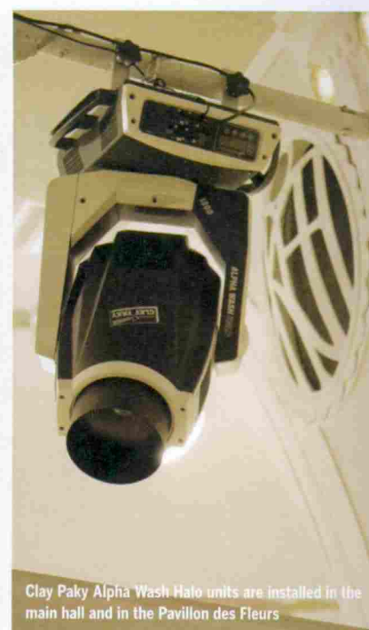
Clay Paky Alpha Wash Halo units are installed in the main hall and in the Pavillon des Fleurs