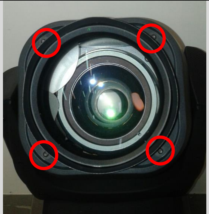
Screw the 4 screws (VTB00G/001) + 4 washers (ROP005) to fix the TopHat to the spacers assembled before.