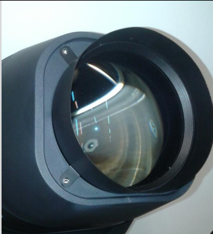
Put the Top Hat in place 322100/001 as shown in the picture.