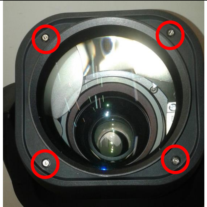
Screw the 4 spacers DIS03R/001.