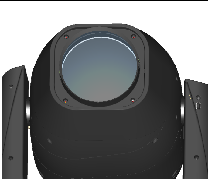
Put in place the front plastic cover without the screws.